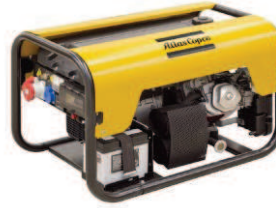
Genset image for illustration purposes only